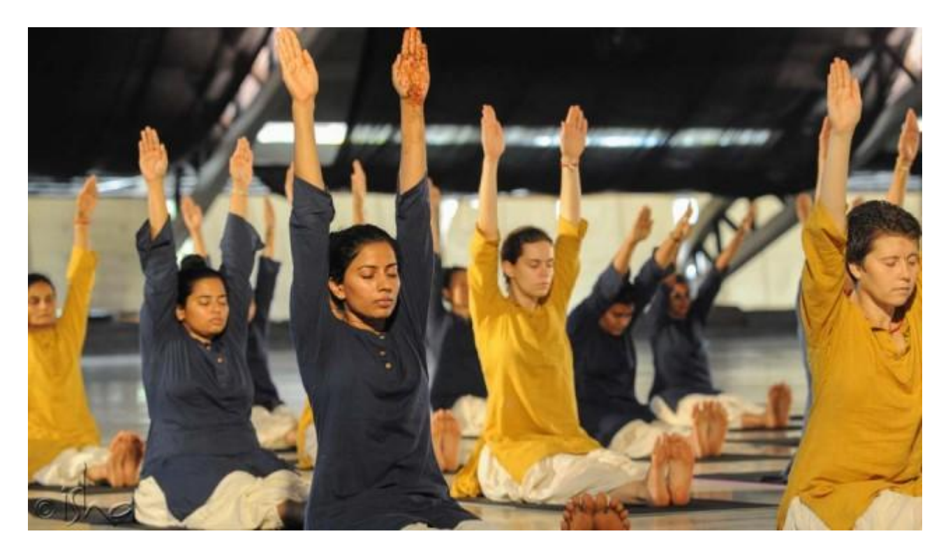
Questioner: Why should we not speak when doing an asana or correct others while they are in an asana?

Sadhguru: An <u>asana</u> is a dynamic way of meditating. Because you cannot sit still, you do something else to become meditative. To take you back to the Yoga Sutras – <u>Patanjali</u> said sthiram sukham asanam . That which is absolutely stable and comfortable is an asana. This means your <u>body is at ease</u>, your <u>mind is at ease</u>, and your energy is vibrant and balanced. Asanas are a preparatory step to come to a state of being naturally meditative. In a way, asanas are a dynamic way of meditating. To think that when you are meditating, you can have a conversation is ridiculous. The same goes for asanas. Speaking triggers a number of changes in your system. You could check this yourself. First sit quietly and check your pulse rate. Then speak intensely and check your pulse rate – it will be very different. The pulse is just one example. Speaking not only changes the physiological parameters – even the energy parameters change dramatically. Above all, without focus, how to do an asana?